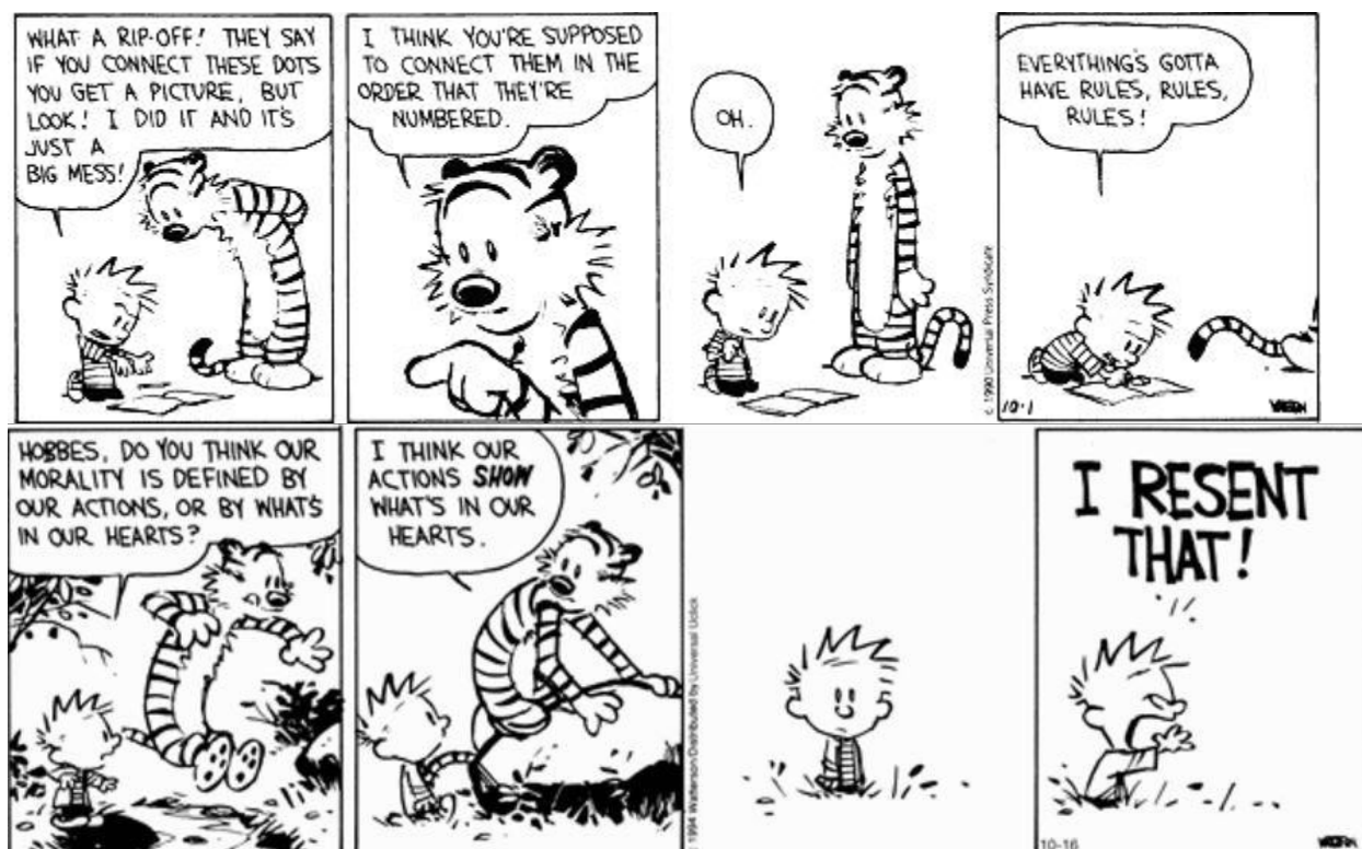
Unit 4 discussion board: