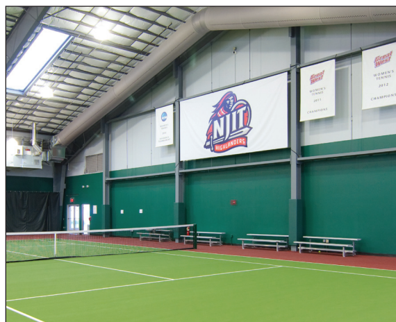
The Naimoli Family Athletic & Recreation Facility

Its indoor tennis courts offer vital year round practice and playing opportunities for NJIT's intercollegiate tennis teams, which have been consistently successful in the transition to Division I. In 2011, the women's tennis team became NJIT's first conference championship team in the Division I era.