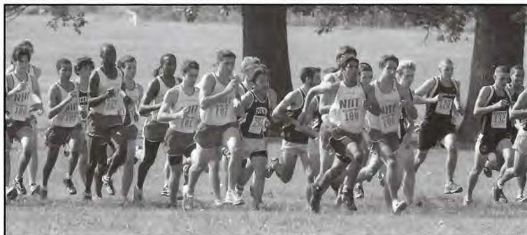
NJIT men's cross country race at Van Cortlandt Park (Bronx, NY)