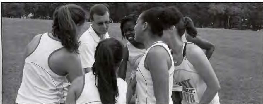
NJIT women's cross country team huddle