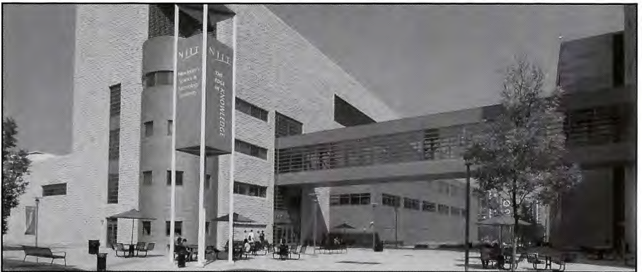
The clock tower and carillon sit in a European style plaza adjacent to the campus center

In recent years, NJIT has put more than $83 million toward new and improved buildings and facilities on the 45-acre campus, including biomedical engineering labs and a campus center.