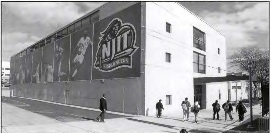
Estelle and Zoom Fleisher Athletic Center (home of the men's and women's basketball & volleyball teams )

In 2005, NJIT and the Newark Bears announced a 10-year partnership that cemented the downtown stadium as home of all Highlander home games.