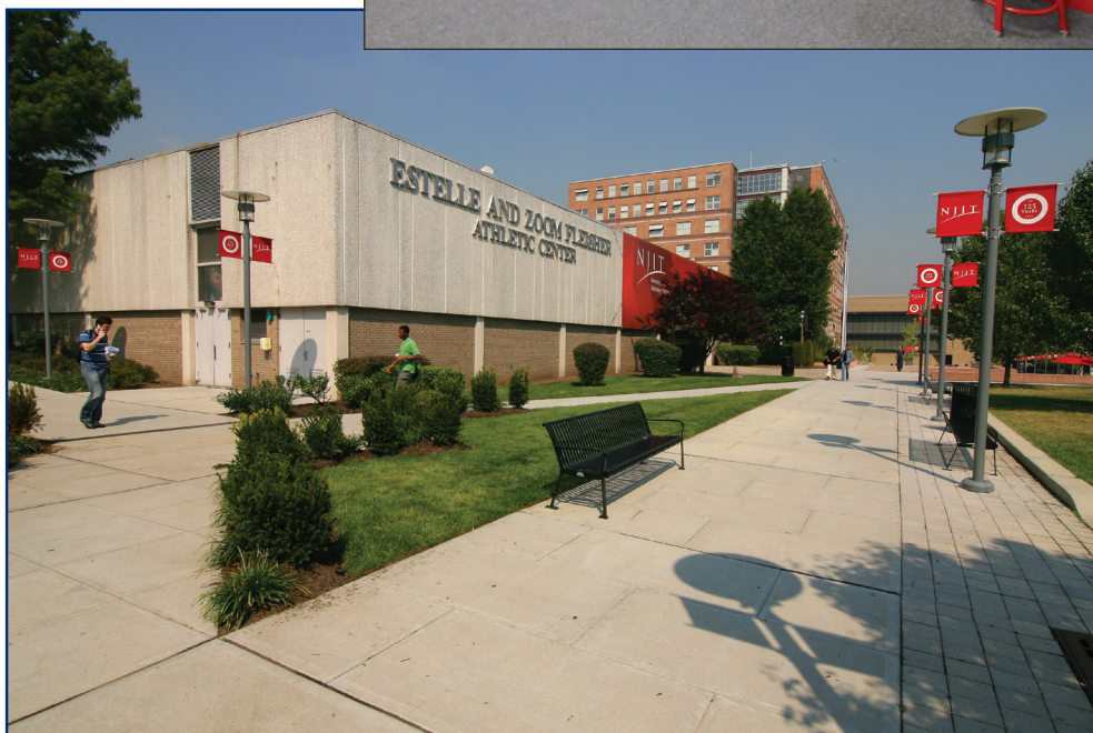
Top inset: Women's volleyball locker room at the (bottom) Estelle and Zoom Fleisher Athletic Center

A six-lane swimming pool in Fleisher Athletic Center is home to the NJIT swimming team. Fencing has its own area on the second floor of the building.