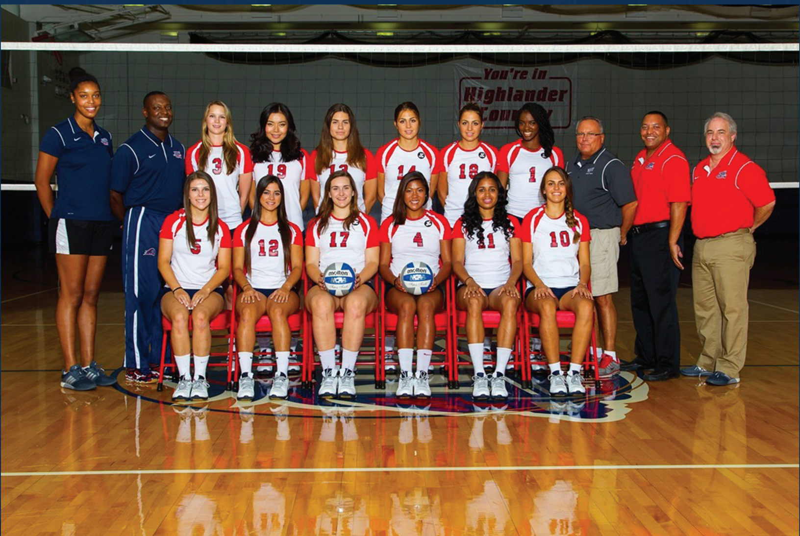
2015 Highlanders Women's Volleyball