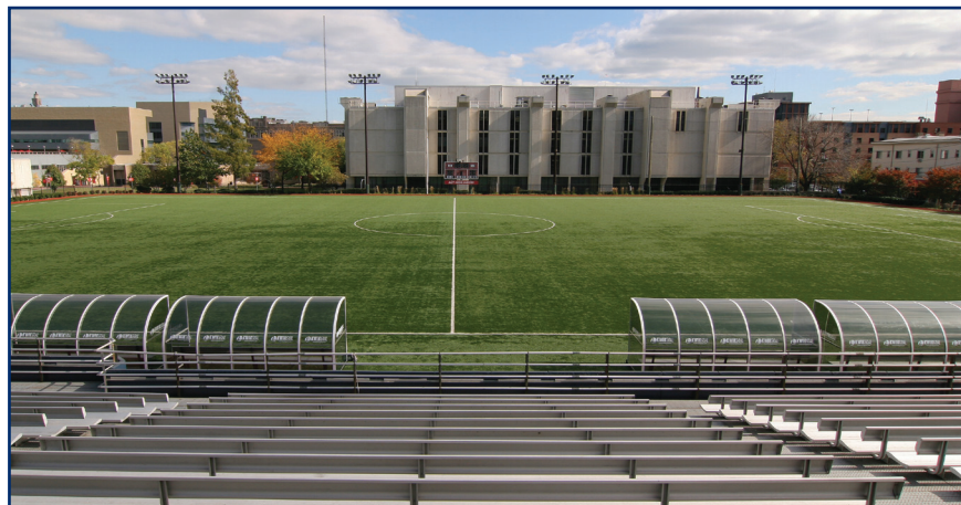
Lubetkin Field at Mal Simon Stadium

In the fall of 2005, when the Northeast was hit with record rainfall, games went on without a hitch at Lubetkin Field, thanks to the quality of the surface. Indeed, with the rain disrupting schedules around the region, some crucial Big East contests involving Seton Hall were moved to NJIT's home field. Those games, too, went off without a hitch.