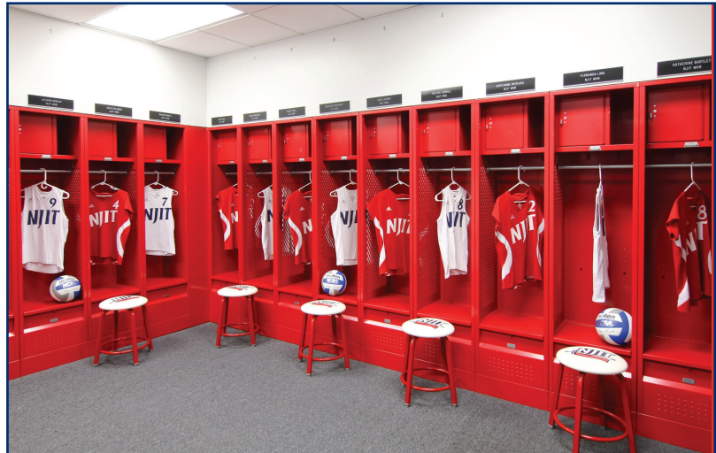
Women's volleyball locker room at Estelle and Zoom Fleisher Athletic Center

In addition to all athletic department offices, the Fleisher Athletic Center also houses the sports medicine staff in the Athletic Training Room and the varsity weight room, supervised by the head strength and condition coach. The building's third floor is home to a fitness center, which is open for use by all students and staff.