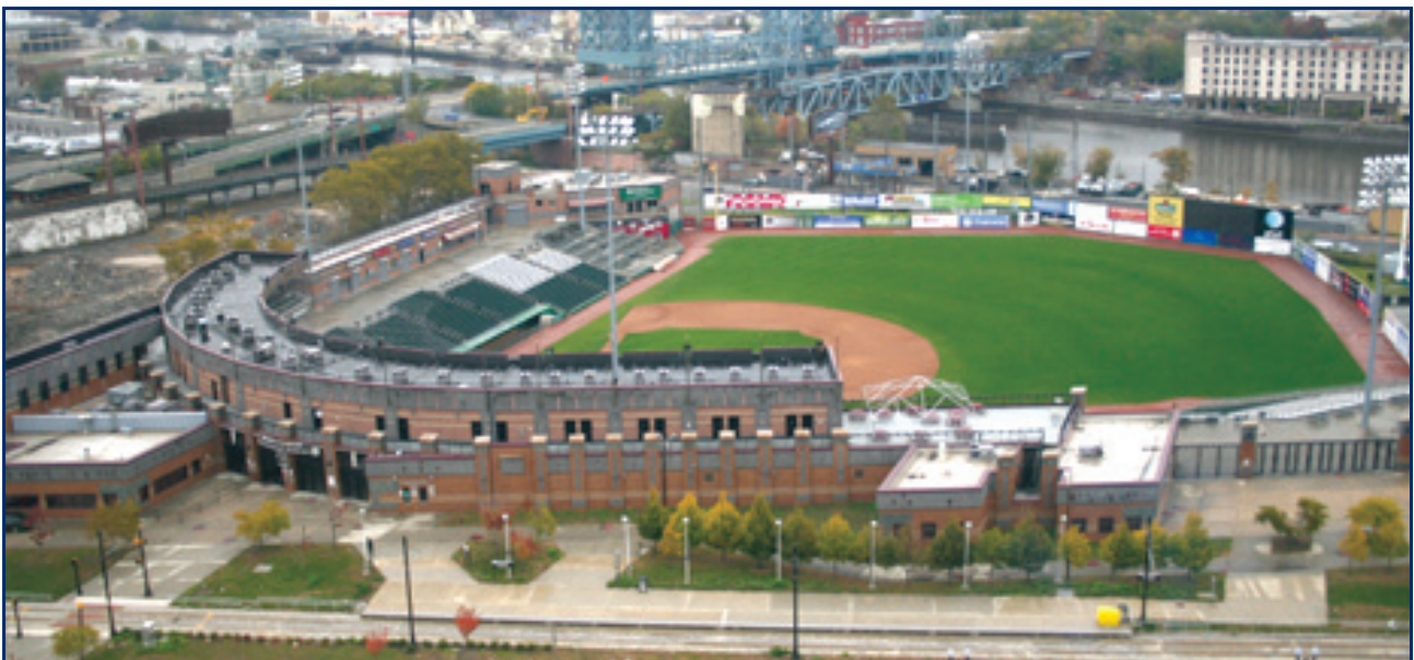
Bears and Eagles Riverfront Stadium

The name, Bears and Eagles Riverfront Stadium, honors Newark's rich baseball history. The original Bears were a farm team for the New York Yankees up until 1949 and the Eagles were a very successful Negro League team that played in Newark until 1950.