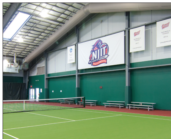
The Naimoli Family Athletic & Recreation Facility

Its indoor tennis courts offer vital year round practice and playing opportunities for NJIT's intercollegiate tennis teams, which have been consistently successful in the transition to Division I. In 2011, the women's tennis team became NJIT's first conference championship team in the Division I era.