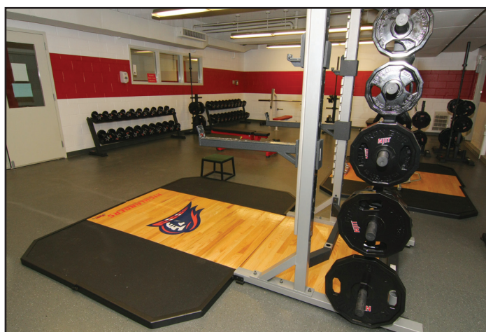
NJIT Athletics Weight Room at Estelle and Zoom Fleisher Athletic Center

In 2009, NJIT hosted the Great West Conference championships at Van Cortlandt Park in the Bronx, and the course, which is home to some of the most prestigious events in the sport, is also the home venue for other annual NJIT-hosted races. Branch Brook Park, which is a public park of Essex County, reaches into several towns, including Newark, with the park entrance less than a mile from the NJIT campus.