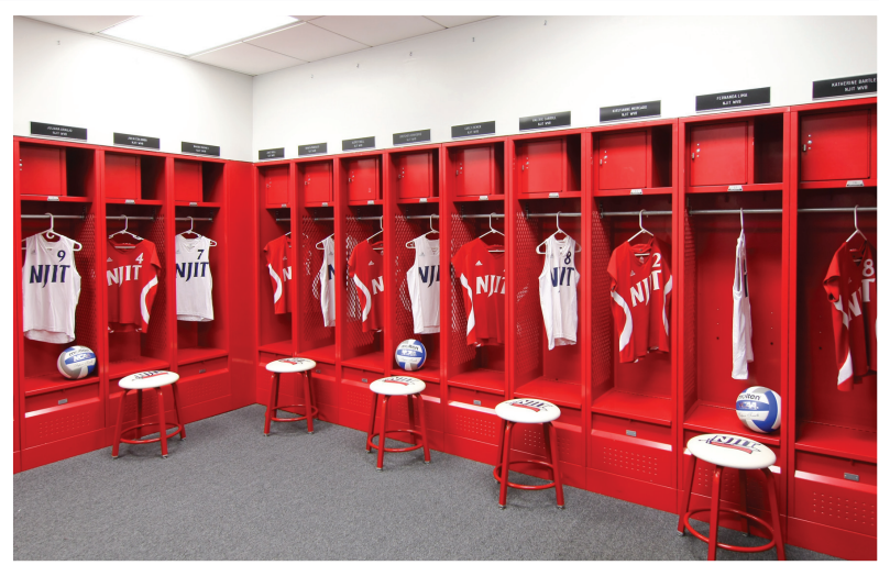
Women's volleyball locker room at Estelle and Zoom Fleisher Athletic Center