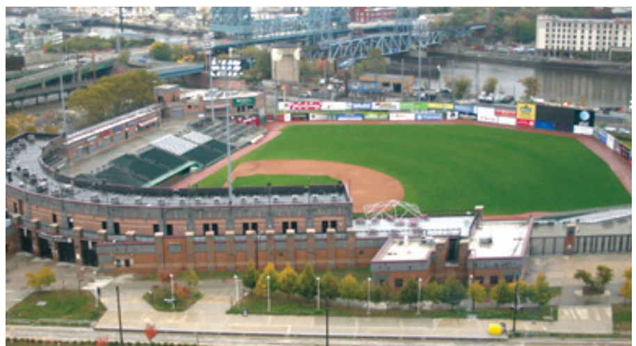
Bears and Eagles Riverfront Stadium

The name, Bears and Eagles Riverfront Stadium, honors Newark's rich baseball history. The original Bears were a farm team for the New York Yankees up until 1949 and the Eagles were a very successful Negro League team that played in Newark until 1950.