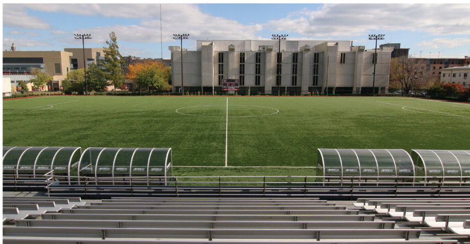
Lubetkin Field at J. Malcolm Simon Stadium

In addition to all athletic department offices, the Fleisher Athletic Center also houses the sports medicine staff in the Athletic Training Room and the varsity weight room, supervised by the head strength and condition coach. The building's third floor is home to a fitness center, which is open for use by all students and staff.