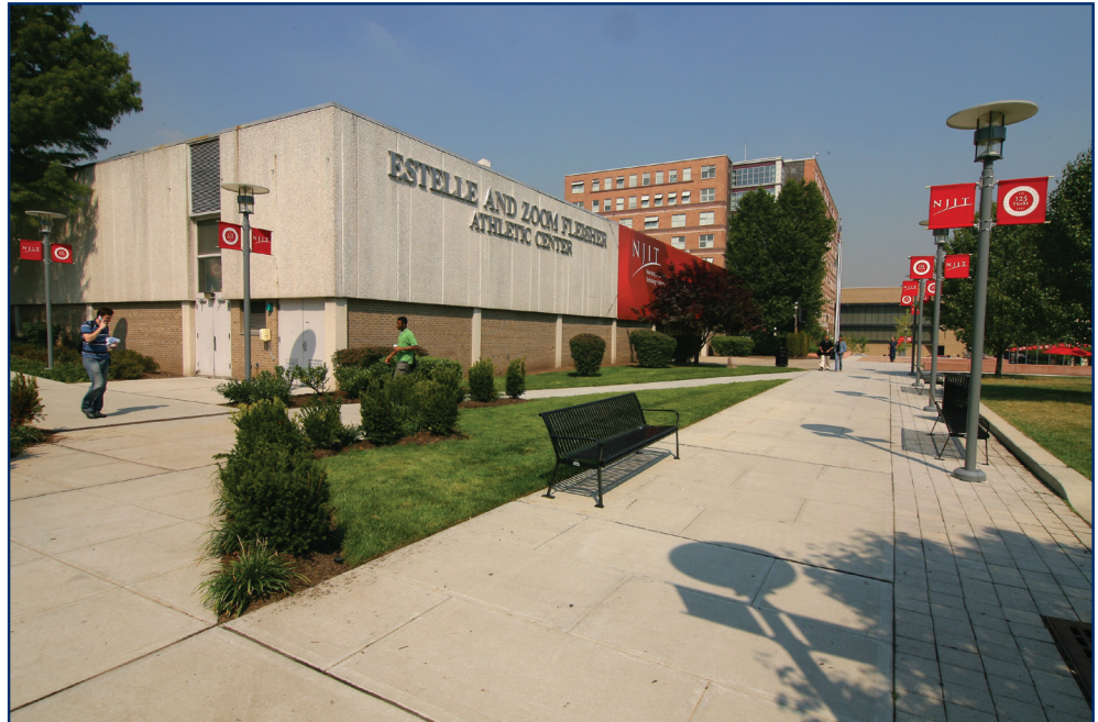
The Estelle and Zoom Fleisher Athletic Center

In the fall of 2005, when the Northeast was hit with record rainfall, games went on without a hitch at Lubetkin Field, thanks to the quality of the surface. Indeed, with the rain disrupting schedules around the region, some crucial Big East contests involving Seton Hall were moved to NJIT's home field. Those games, too, went off without a hitch.