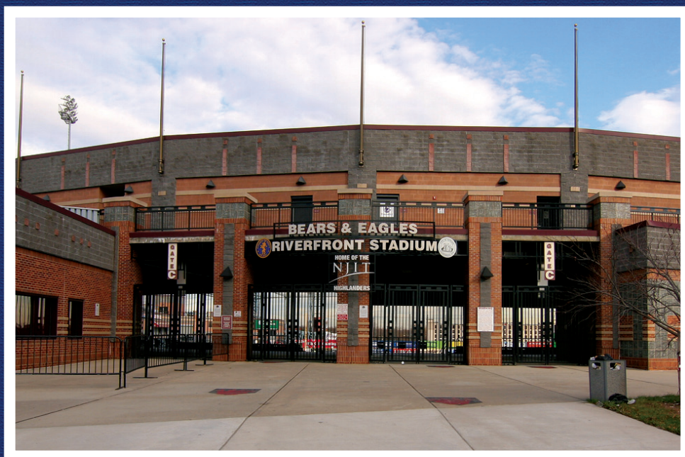
Bears and Eagles Riverfront Stadium

In December 2005, NJIT and the Bears held a joint press conference to herald a new partnership that includes a 10-year deal that extends Bears and Eagles Riverfront Stadium as the home of NJIT Highlanders baseball.