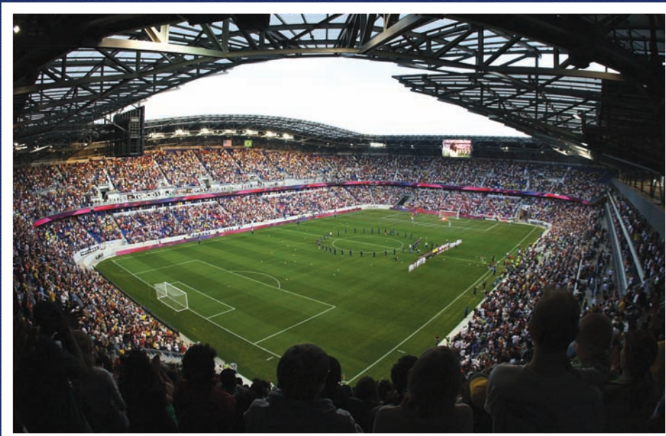
Red Bull Arena

club seats. Other amenities include three stadium clubs and two retail outlets.