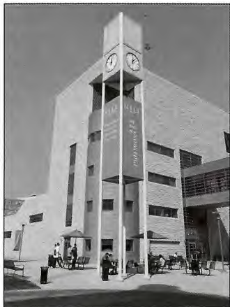
The clock tower and carillon sit in a European-style plaza adjacent to the Campus Center.

Today, continuing a fourfold mission of instruction, research, economic development and public service, NJIT is among the leading comprehensive technological universities in the nation, with state-of-the-art facilities on its 45-acre campus in Newark and a solar observatory in Big Bear, California.