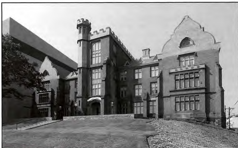
Above/Below: Photos of NJIT's Campus