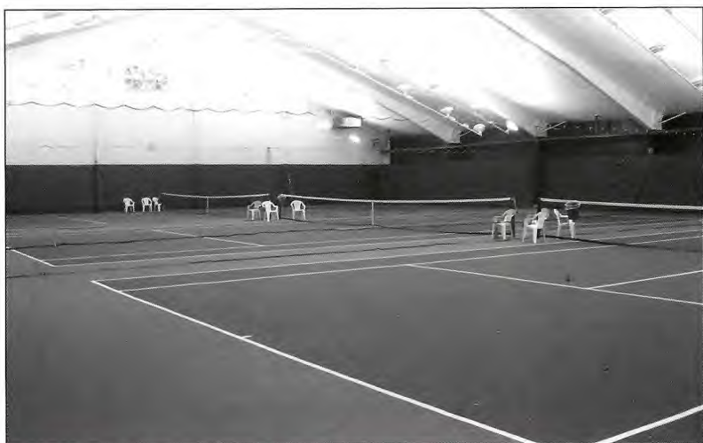
Above: Tenaflly Racquet Courts; Below: Tiger Tennis Fitness