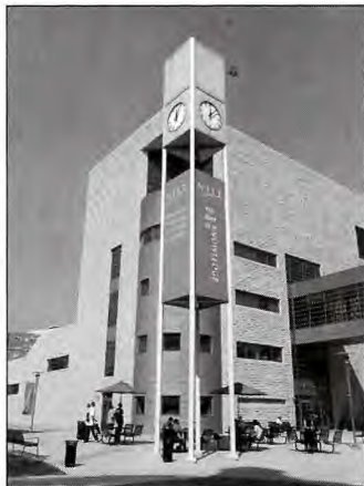
The clock tower and carillon sit in a European-style plaza adjacent to the Campus Center.

Today, continuing a fourfold mission of instruction, research, economic development and public service, NJIT is among the leading comprehensive technological universities in the nation, with state-of-the-art facilities on its 45-acre campus in Newark and a solar observatory in Big Bear, California.