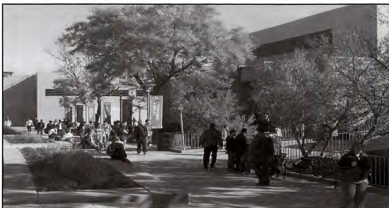
Above/Below: Photos of NJIT's Campus