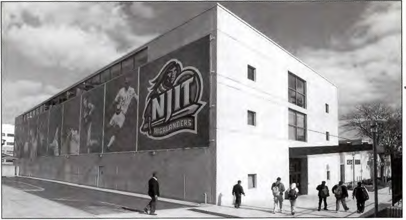
Above: Fleisher Athletic Center (home of the men's & women's basketball teams)