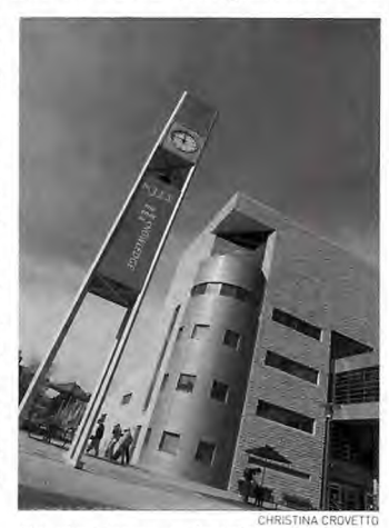
The clock tower and carillon sit in a Eu-

Today, continuing a fourfold mission ropean-style plaza adjacent to the newlyof instruction, research, economic develop-renovated Campus Center. ment and public service, NJIT is among the leading comprehensive technological universities in the nation, with state-of-the-art facilities on its 45acre campus in Newark and a solar observatory in Big Bear, California.