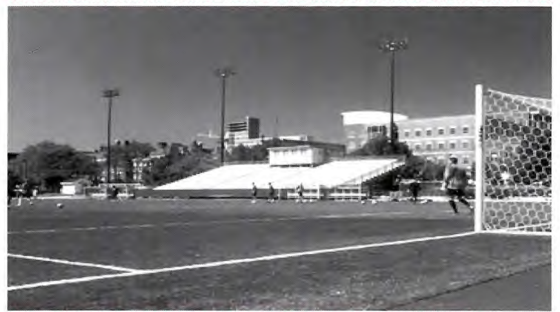
Above: Lubetkin Field (home of the men's & women's soccer teams)