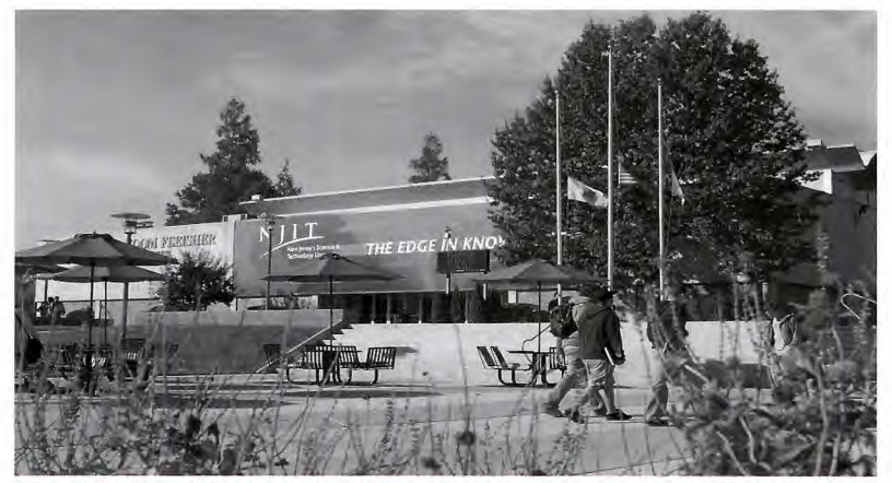
Above: Fleisher Athletic Center (home of the men's & women's basketball teams,