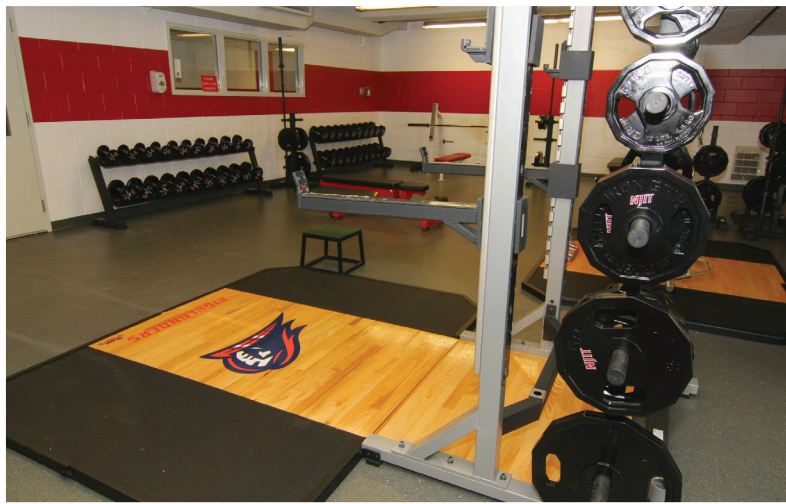
NJIT Athletics Weight Room at Estelle and Zoom Fleisher Athletic Center