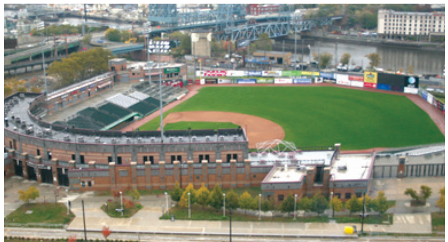
Bears and Eagles Riverfront Stadium

The name, Bears and Eagles Riverfront Stadium, honors Newark's rich baseball history. The original Bears were a farm team for the New York Yankees up until 1949 and the Eagles were a very successful Negro League team that played in Newark until 1950.