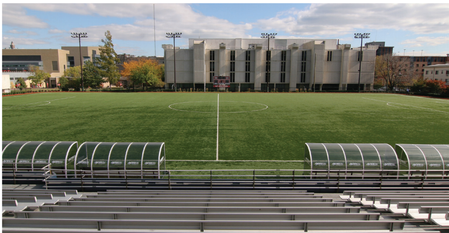
Lubetkin Field at Mal Simon Stadium

In addition to all athletic department offices, the Fleisher Athletic Center also houses the sports medicine staff in the Athletic Training Room and the varsity weight room, supervised by the head strength and condition coach. The building's third floor is home to a fitness center, which is open for use by all students and staff.