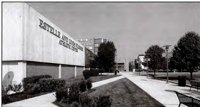
Estelle and Zoom Fleisher Athletic Center, home of the NJIT Highlanders