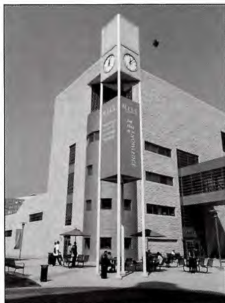
The clock tower and carillon sit in a European-style plaza adjacent to the Campus Center.

Today, continuing a fourfold mission of instruction, research, economic development and public service, NJIT is among the leading comprehensive technological universities in the nation, with state-of-the-art facilities on its 45-acre campus in Newark and a solar observatory in Big Bear, California.