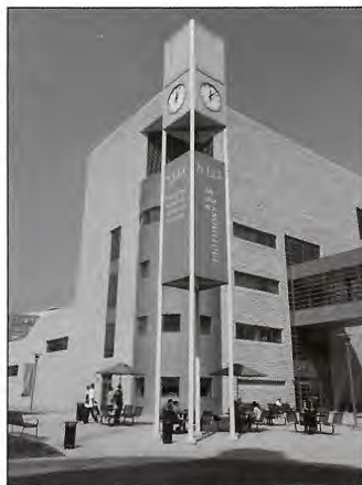
The clock tower and carillon sit in a European-style plaza adjacent to the Campus Center.

Today, continuing a fourfold mission of instruction, research, economic development and public service, NJIT is among the leading comprehensive technological universities in the nation, with state-of-the-art facilities on its 45-acre campus in Newark and a solar observatory in Big Bear, California.