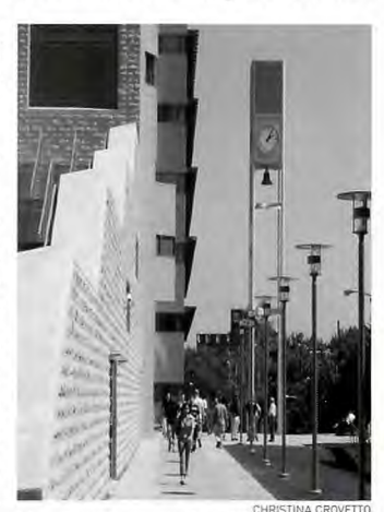
The clock tower and carillon sit in a European-style plaza adjacent to the newly-renovated Campus Center.

Over time, the university both anticipated and responded to change by expanding its curriculum and mission. Most notably, in 1919, the university established baccalaureate programs in three engineering fields. By 1975, NJIT offered a broad range of undergraduate and graduate degrees. All programs included significant research and public service components with the goal of providing an academic environment that fostered intellectual depth and breadth, as well as social responsibility.