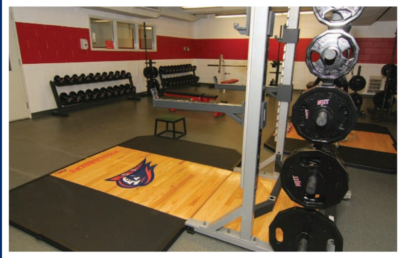
NJIT Athletics Weight Room at Estelle and Zoom Fleisher Athletic Center