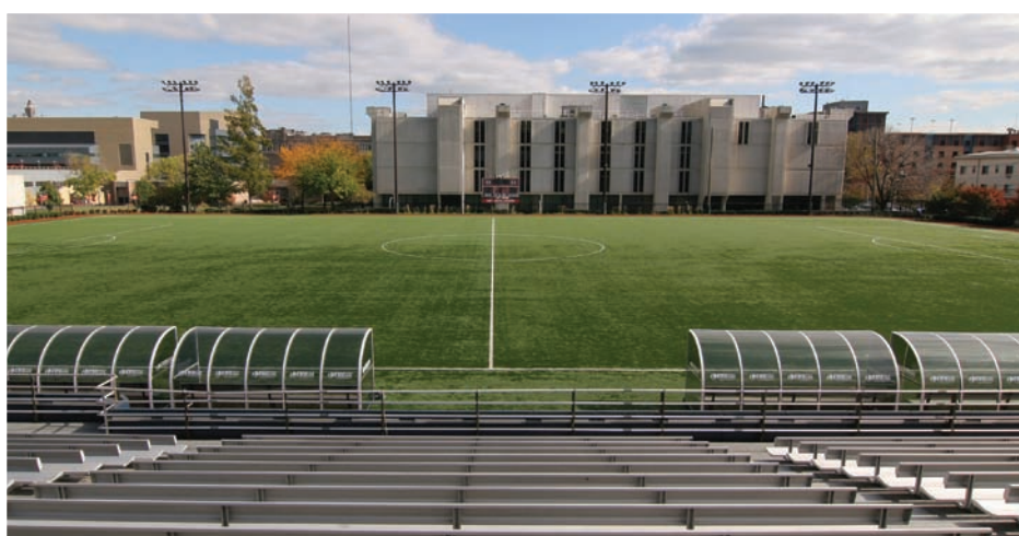
Lubetkin Field at J. Malcolm Simon Stadium

In the summer of 2006, the gym underwent renovation to include installation of a new floor and baskets, new lighting, new sound system and new scoreboards, along with entirely new seating for approximately 1,500 spectators after the first phase of renovation. The back bay 'C gym' can be sectioned off from the main competition floor, making the facility useful for intramurals, physical education classes and campus recreation time, while being able to host multiple simultaneous events.