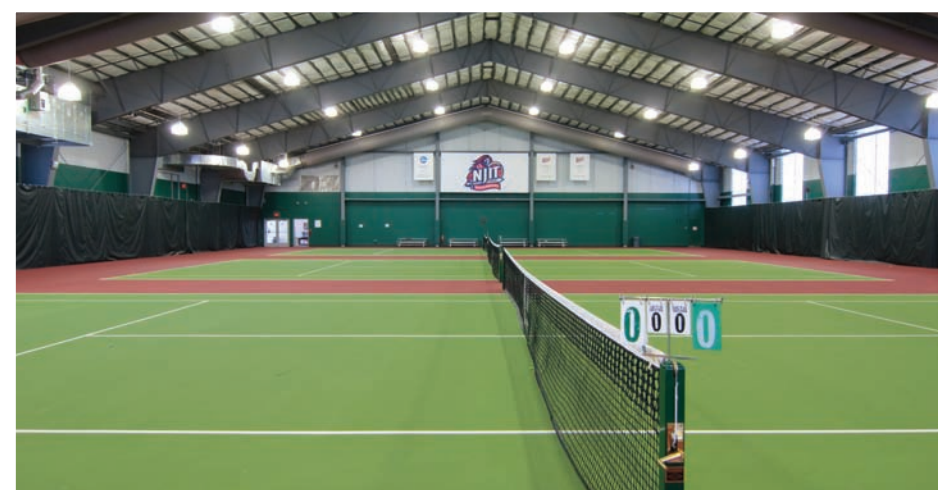
The Naimoli Family Athletic & Recreation Facility