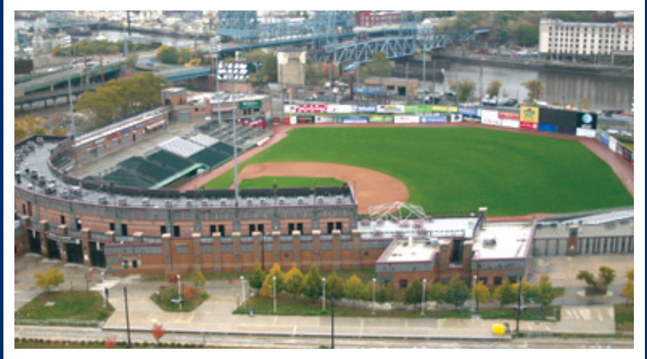
Bears and Eagles Riverfront Stadium

A six-lane swimming pool in Fleisher Athletic Center is home to the NJIT swimming team. Fencing has its own area on the second floor of the building.