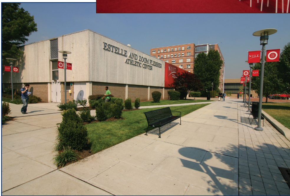
Top inset: Soccer locker room at the (bottom) Estelle and Zoom Fleisher Athletic Center

A six-lane swimming pool in Fleisher Athletic Center is home to the NJIT swimming team. Fencing has its own area on the second floor of the building.