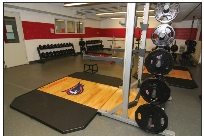
NJIT Athletics Weight Room at Estelle and Zoom Fleisher Athletic Center

The NJIT men's and women's indoor track & field team trains at the Jersey City Armory which is home to a 6-lane indoor 200m track while the outdoor track & field team trains at the Nat Turner Park 6-lane outdoor 400m track.