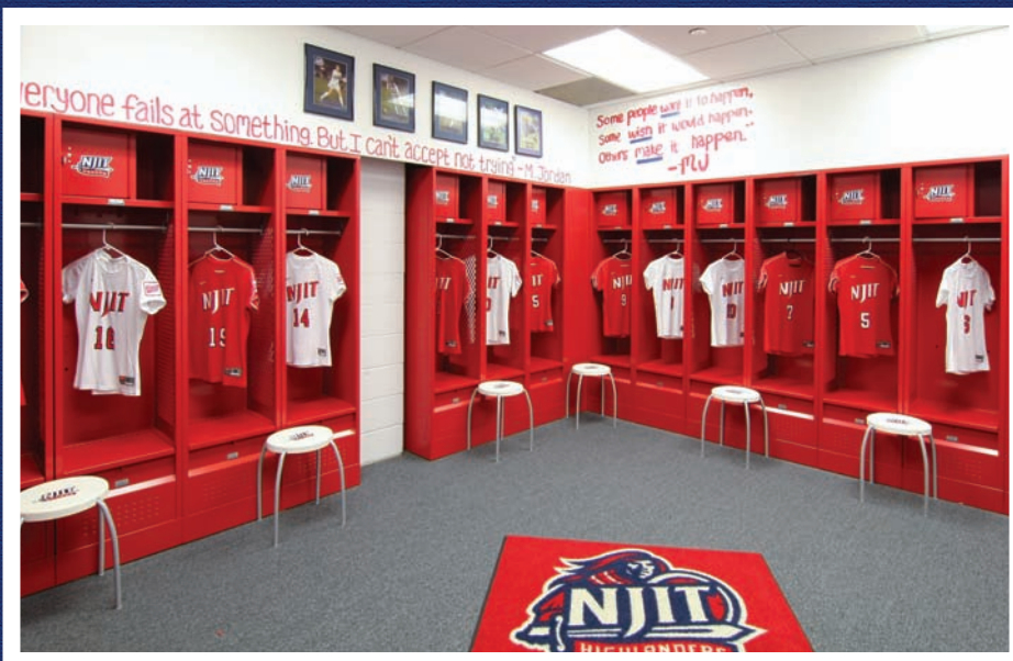
Soccer locker room at Estelle and Zoom Fleisher Athletic Center

With a seating capacity of 6,200 Bears and Eagles Riverfront Stadiums affords everyone in attendance an up-close view of the action. The ballpark also has 20 luxury suites, a picnic area, a party deck, a concert stage situated behind the outfield wall and a major league-caliber press box featuring