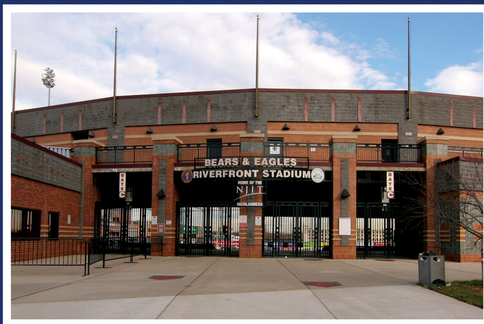
Bears and Eagles Riverfront Stadium

In December 2005, NJIT and the Bears held a joint press conference to herald a new partnership that includes a 10-year deal that extends Bears and Eagles Riverfront Stadium as the home of NJIT Highlanders baseball.