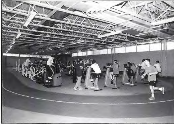
The Fleisher fitness center features computer-controlled biking equipment, Cybex resistance units, and an indoor track.

The NJIT soccer teams play their home games at Lubetkin Field (see page 16), a lighted campus facility, with a newly-installed SprinTurf surface, adjacent to the Estelle and Zoom Fleisher Athletic Center .