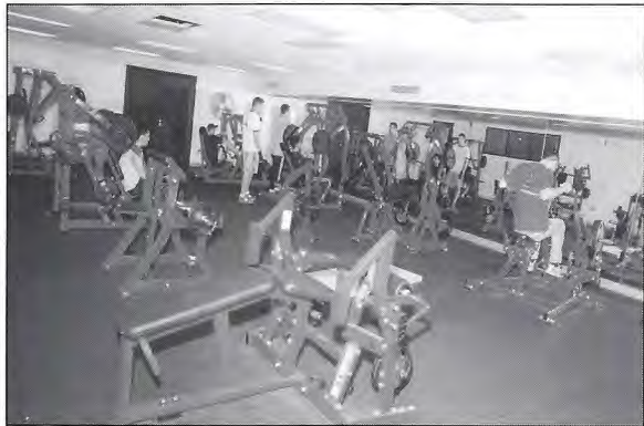
NJIT's hammer-strength weight room, in the basement of the Fleisher Athletic Center.

games in Entwisle Gymnasium , the main facility in the Fleisher Center. Entwisle seats approximately 1,500 spectators. The back bay, "C gym," area can be sectioned off from the main floor, making the entire gymnasium useful for intramurals, physical education classes, and campus recreation time, and able to host multiple events simultaneously.