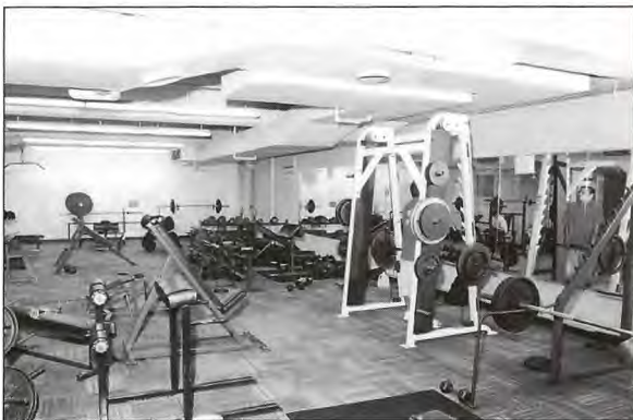
NJIT's weight room, in the basement of the Fleisher Athletic Center.

The facilities are also used by NJIT's club sport offerings, which include bowling, cricket, golf, judo, men's lacrosse and wrestling.