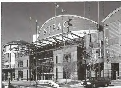
The New Jersey Performing Arts Center in downtown Newark