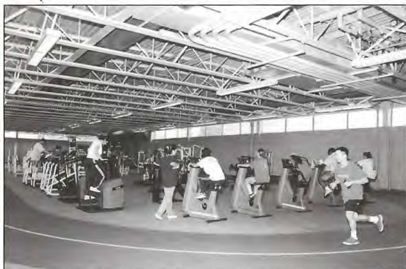
The Fleisher fitness center features computer-controlled biking equipment, Cybex resistance units, and an indoor track.

Lubetkin, which is also home to the Highlanders' baseball team, contains a scoreboard and pressbox facilities, and has seating to hold approximately 1,000 spectators. The field is also used for physical education and intramurals.