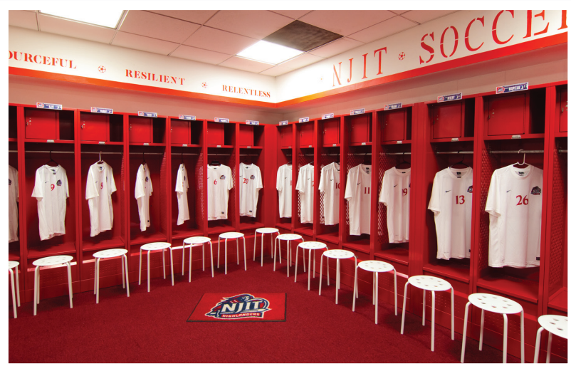
Soccer locker room at Estelle and Zoom Fleisher Athletic Center