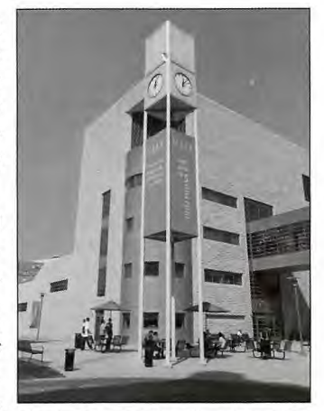
The clock tower and carillon sit in a European-style plaza adjacent to the Campus Center.

Over time, the university both anticipated and responded to change by expanding its curriculum and mission. By 1975, NJIT offered a broad range of undergraduate and graduate degrees. All programs included significant research and public service components with the goal of providing an academic environment that fostered intellectual depth and breadth, as well as social responsibility.