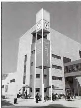
The clock tower and carillon sit in a European-style plaza adjacent to the Campus Center.

Today, continuing a fourfold mission of instruction, research, economic development and public service, NJIT is among the leading comprehensive technological universities in the nation, with state-of-the-art facilities on its 45-acre campus in Newark and a solar observatory in Big Bear, California.