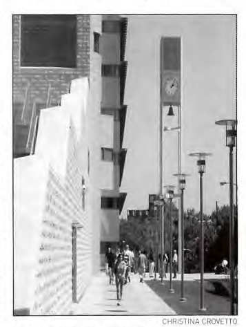
The clock tower and carillon sit in a European-style plaza adjacent to the newlyrenovated Campus Center.

Over time, the university both anticipated and responded to change by expanding its curriculum and mission. Most notably, in 1919, the university established baccalaureate programs in three engineering fields. By 1975, NJIT offered a broad range of undergraduate and graduate degrees. All programs included significant research and public service components with the goal of providing an academic environment that fostered intellectual depth and breadth, as well as social responsibility.