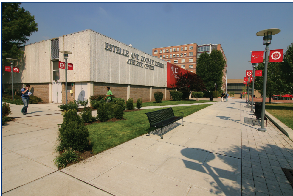
The Estelle and Zoom Fleisher Athletic Center

In the fall of 2005, when the Northeast was hit with record rainfall, games went on without a hitch at Lubetkin Field, thanks to the quality of the surface. Indeed, with the rain disrupting schedules around the region, some crucial Big East contests involving Seton Hall were moved to NJIT's home field. Those games, too, went off without a hitch.