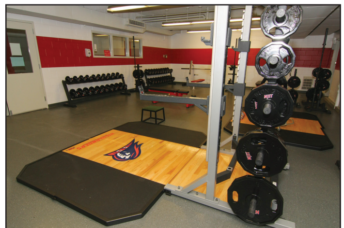
NJIT Athletics Weight Room at Estelle and Zoom Fleisher Athletic Center

The NJIT men's and women's indoor track & field team trains at the Jersey City Armory which is home to a 6-lane indoor 200m track while the outdoor track & field team trains at the Nat Turner Park 6-lane outdoor 400m track.