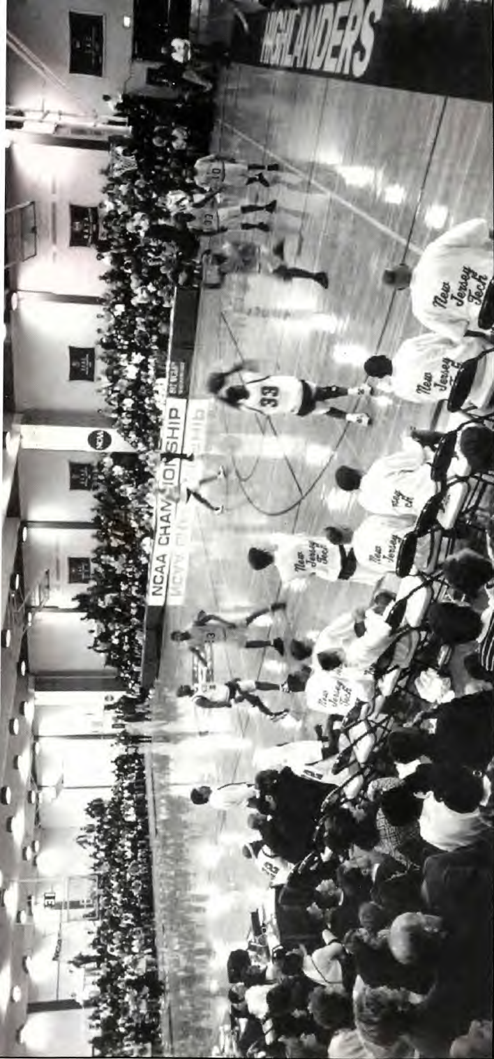
The Highlanders play their home games in Entwistle Gymnasium.